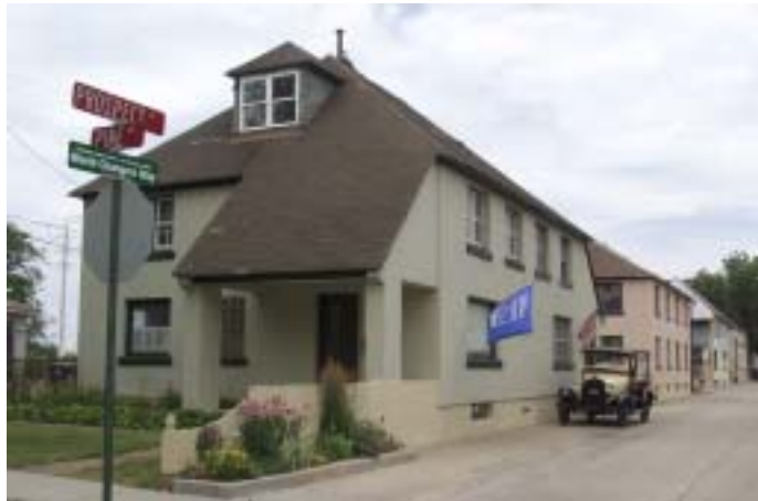
Above: The first two buildings on Prospect in the Marktown Historic after the work was completed. What a difference!

Why these two blocks? That's simple. Both are in redevelopment areas. The old