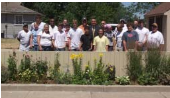
Top: World Changers crews begin the work on two of the five buildings in the Marktown Historic District.