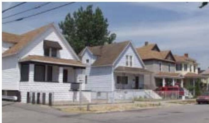
Below: Homes on the 136th block of Grand Boulevard in the Carnegie Library - Grand Boulevard Historic District.