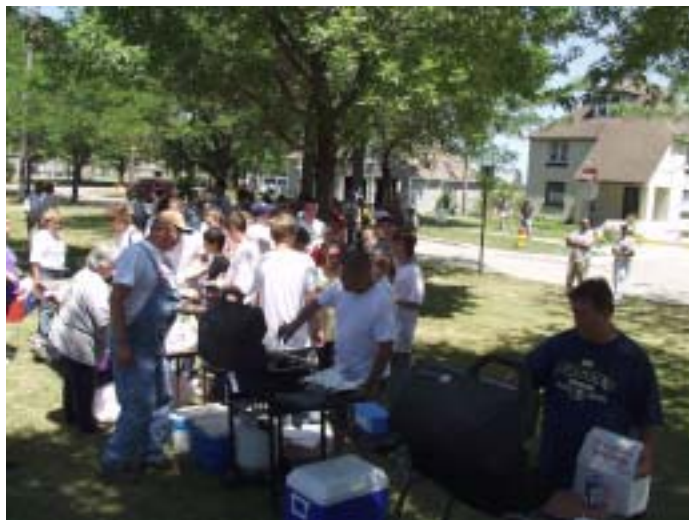
Top: World Changers crews lunch in the shade of the trees in the Marktown Park before going back to work.