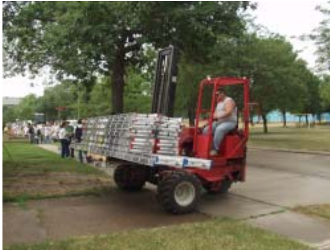
Above: A forklift truck drops off a pallet of ladders at the Marktown job site early Monday morning.