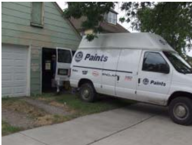
Below: ICI Delux Paints in Hammond makes the first of several deliveries to the Marktown portion of the project.

This special edition of Marktown Update is available in full color at our website at www.marktown.org