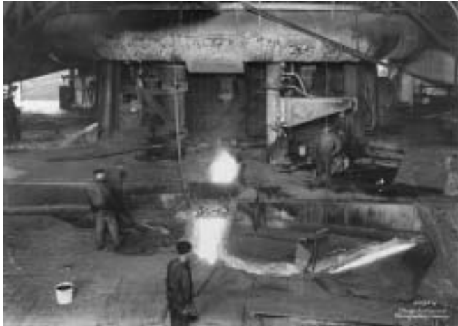
Marktown began with the building of a modern manufacturing facility on the shore of Lake Michigan in 1913.

Born of steel and tempered in oil.... In Ripley's Believe It Or Not for being the only community in North America where the cars park on the sidewalk and people walk in the Street. And yes, even listed as the 8th Wonder of the World, tiny Marktown has earned its place in history, but more importantly, can and should be a viable neighborhood for generations to come.