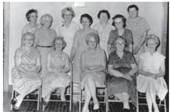
Ladies from Marktown gathered regularly to roll bandages for the war effort and the American Cancer Soc.