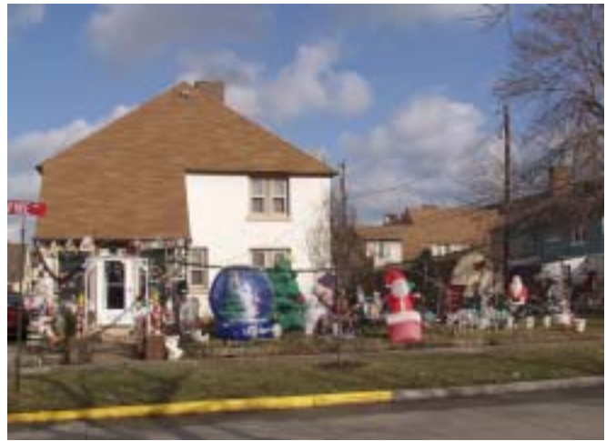
Above: Once again our friends and neighbors at 401 Lilac Street greeted residents and visitors alike with their overwhelming Christmas display. The Camacho Family makes it a point of decorating for Halloween, Thanksgiving and yes, Christmas.