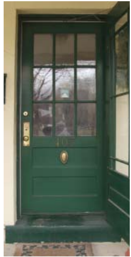
36" - 9 light door used on the six room cottages (along Park Street).