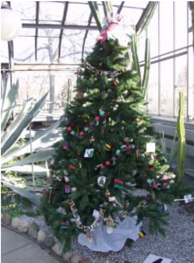
Christmas decorating began early once again as the children from the Marktown Historic District participated in the annual tree decorating contest at the Washington Park Greenhouse. This year's theme for the Marktown tree was Kwansa.