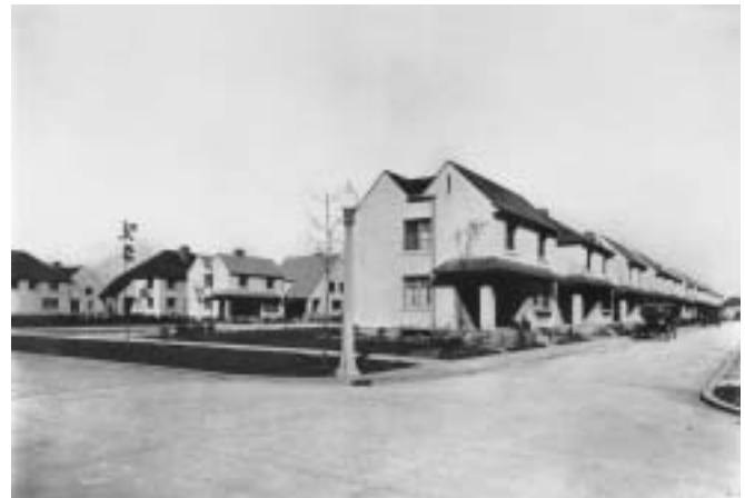
And with that work force came the need for modern, quality housing for their workers and families!