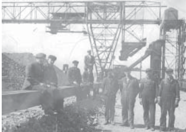
With the manufacturing of steel came a need for a skilled work force to man the mighty mills.