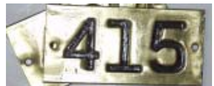
Brass plates were used to provide house numbers on each home.

Following the change in street numbers and names in 1923, brass plates were used on each door to denote the street address.