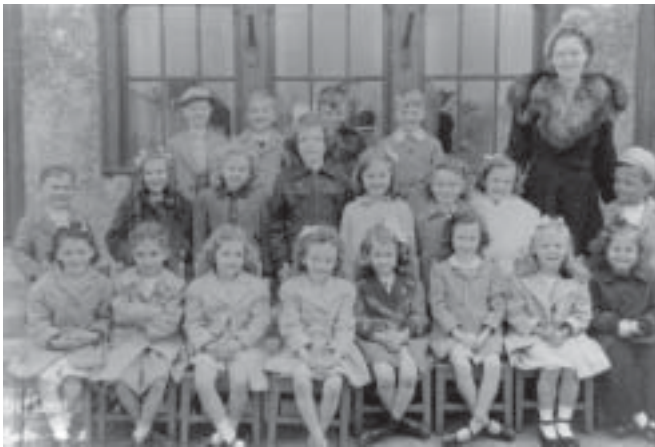
A group of grade school children pose for their annual class photo on the steps of the Mark School Building.

nearly every item that was needed then is taken for granted today. In reviewing reports that detailed worker housing conditions of the late 1800s and early 1900s nearly everything that we take for granted today was missing back then.