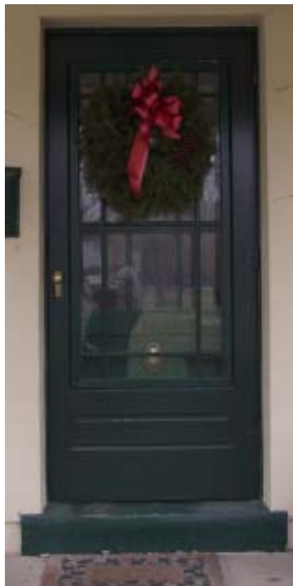
Classic Arts & Crafts styled storm doors graced all Marktown homes.

Ever try to figure out the styles of the original Marktown doors? Believe it or not they are not all the same, or are they? All of the back doors were 33" - 6 light (window) doors.