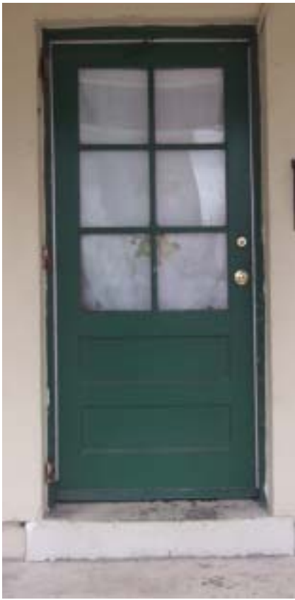
36" - 6 light door used on the six room duplex and the Marktown Quads.