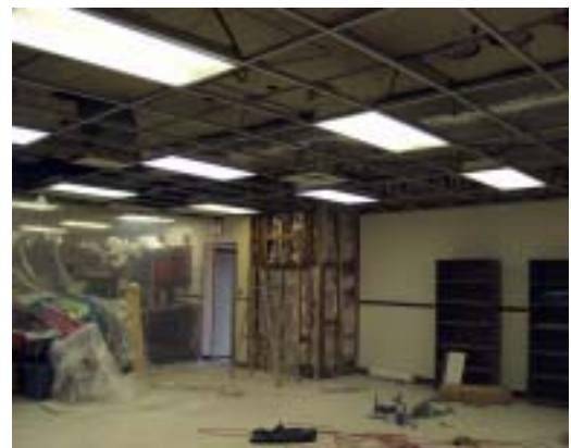
Day one of the renovation process!

What is being done you ask? To begin: a new ceiling and floor, washroom renovations, enlarged storage closets, an expanded kitchen with additional storage, not to mention the replacement of the old panelling with drywall. Hopefully the handicap ramp will be brought up to code and the parking lot paved during this project and long before the May elections.