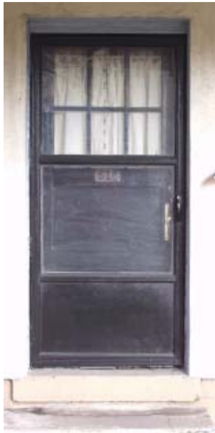
36" - 4 light door used on the seven and four room duplex homes.