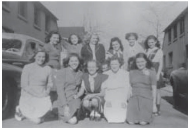
Young ladies from Marktown gather for a birthday photo on the streets of Marktown. Recognize anyone?

With the participation of all of the residents and the cooperation of the various civic groups, our future should be a bright one for generations to come.