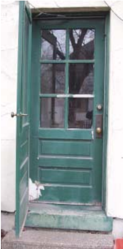
33" - 6 light door used as the rear door on all of the Marktown homes.