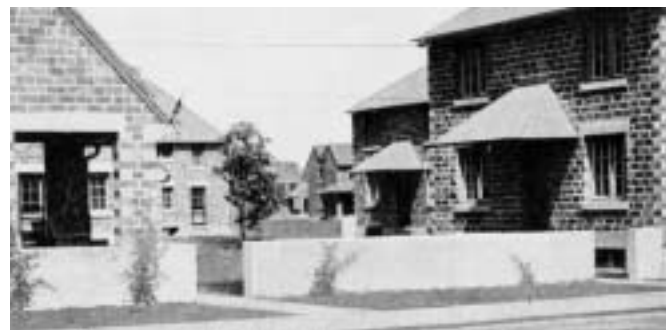
Marktown during construction in 1918. The photo was not a part of the original article.

While the new homes will not take care of the several thousand worker to be employed by the Mark Tube Works, yet they will help to relieve the housing situation and it is not at all unlikely that more will be built.