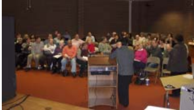
Above: East Chicago residents and governmental staff members met at Central High School for the recently released Supplemental Risk Assessment.

The entire supplemental risk assessment as well as a fact sheet are available online at: epa.gov/region5/sites/indianaharbor .