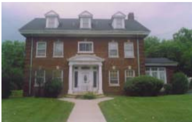
Who in this city does not want to see the classic homes in Washington Park maintained in their classic setting for generations to come? We need to celebrate our architectural heritage and not take it for granted any longer!

One of the other truly great buildings in East Chicago is the old Wickey house on 145th street just north of City Hall. This is East Chicago's only example of a Queen Ann house that is still standing. Built in 1890 it was also one of the first homes in E.C. with electricity. Will it be saved? Will it be