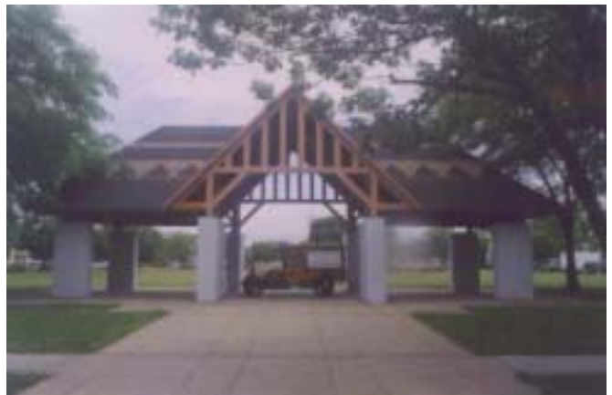
When some of the youth in the neighborhood wrote unpleasantries on the pavilion, their parents made them paint over it. The next week the Marktown Preservation Society bought the paint and repainted the entire pavilion. Now that's working together!