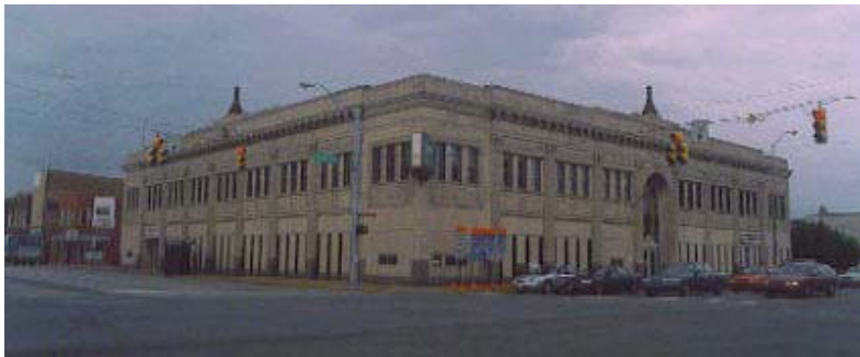
The 1929 First National Bank building has been the commercial anchor at the corner of Indianapolis Blvd. and Chicago Avenue for more than 75 years. It is one of the most architecturally important buildings in all of Northwest Indiana. Developers working for the Walgreens Company want to raze this building to make way for yet another one of their cookie cutter type drug stores.

not listed in the report, after all, it like the Marktown Historic District was not only built at approximately the same time, but Sunnyside was also built as industrial housing for Inland Steel employees. The answer is quite simple. Sunnyside use to be an outstanding example of the arts and crafts movement in this country. Unfortunately the homes were modernized with aluminum siding and modern windows some 30-40 years ago. In doing so all of the architectural features that made it so unique were removed, thus preventing the properties from ever being considered for landmark