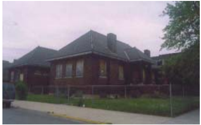
The Grand Boulevard Library which was built at the turn of the last century is slated to become the Carnegie Library Center for the Performing Arts. A commission has been established, an architect is on board and once again, funding is being sought. When completed it will provide a much needed venue for the performing arts in East Chicago while at the same time, saving a most unique link to the historic past of this great city. Music, dance and drama will be taught once again in E.C.