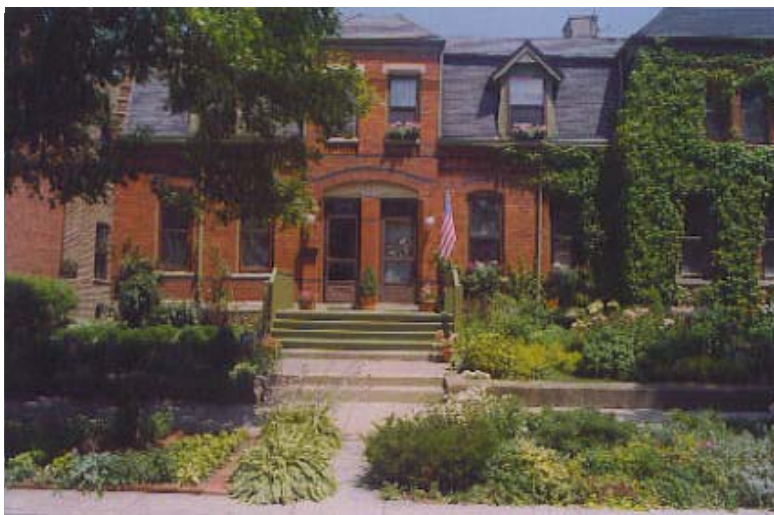
The Pullman Historic District in Chicago stands today as an example of what historic preservation can do for a neighborhood. All they had to do was give historic preservation a chance and work together!

How easy would it be to restore Marktown? Very easy compared to Pullman. We are a smaller community with a common exterior finish of stucco and a unified architectural plan. The windows and doors were all of the same architectural style and we have many of the original plans for our community. So what's the next step? You can wait until the future issues of Marktown Update to find out, or just