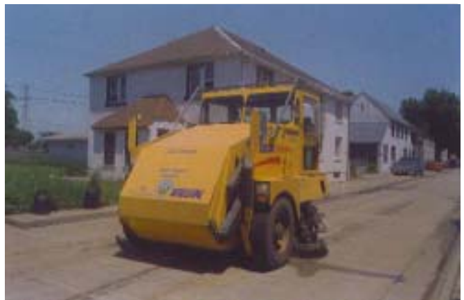
When local residents worked with Paul Myers and the Marktown Preservation Society to clean up four streets in Marktown, the city pitched in immediately and sent out the street sweepers to finish the job. All that the residents had to do was get the dirt and weeds into the street and the city did the rest. Now that's teamwork!