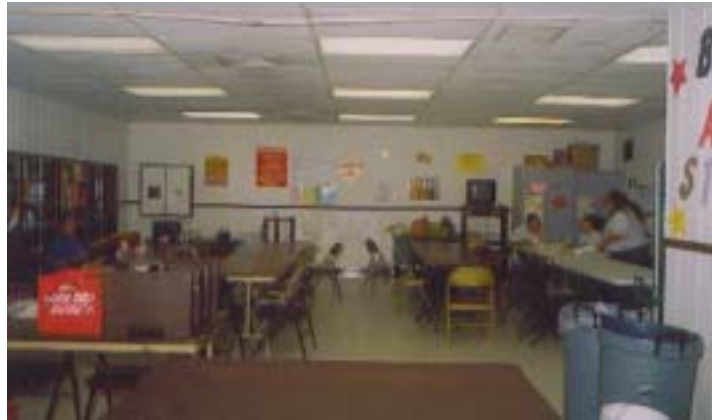
The Marktown Community Center after the most recent repairs. While those responsible for the work did not come nearly close to our expectations, I suppose we should be satisfied with a coat of paint, some new lights and a few new book cases. Maybe if we had all been permitted to work together on the proposed New Marktown Community Center, we wouldn't have to settle for the leftovers and scraps.