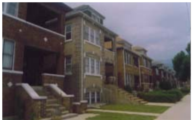
This row of classic Chicago Two-Flats is one of the most unique neighborhoods in this city. The classic line of these homes may be in jeopardy if just one property owner decides to do something inappropriate in this most unique neighborhood.