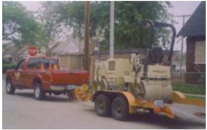
City equipment gets ready to patch pot holes on Spruce Avenue. All it took was to ask and they showed up the very next day with the manpower and equipment to do the repairs. Well Done!

If you have something negative to say, put your money where your mouth is and put it in print for all to see. Let's work TOGETHER for the betterment of Marktown!