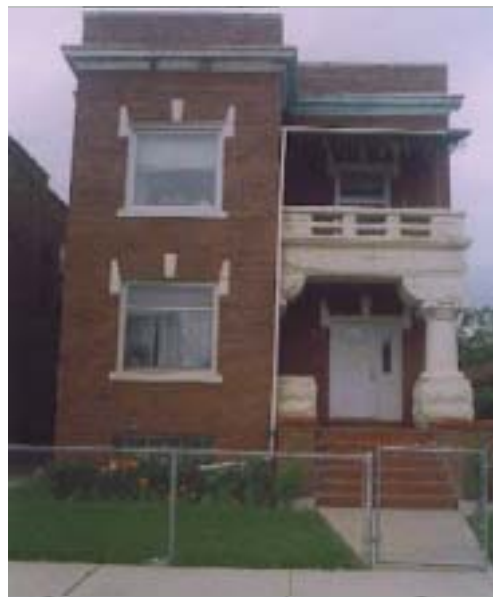
This is by far one of the most unique two-flat homes in all of East Chicago. While the stonework has been painted for several years, the detail of the original building has not been lost. Carved in the header of the front porch support is the name San. Jose, making this building a most unique link to our cultural diversity.

restored to it's former glory? Only time will tell.