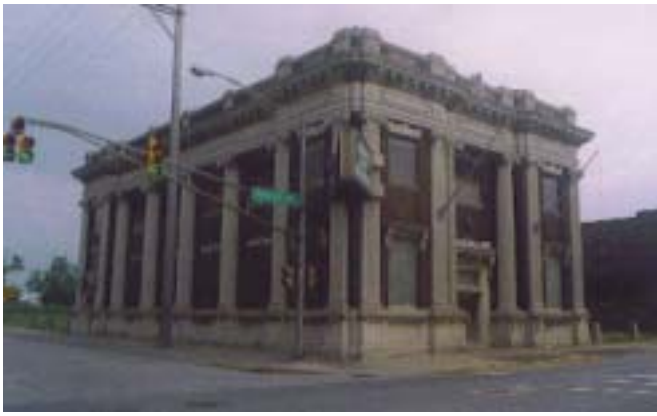
The Riley Bank Building on the corner of Chicago and Kennedy Avenues is slated to become the Riley Center for Cultural Heritage and Historic Preservation. The architectural plans for the restoration and renovation of the building are being completed and the funding is being sought to complete the project. When completed it will host a number of architectural and cultural exhibits and programs while serving as the headquarters for historic preservation in East Chicago.