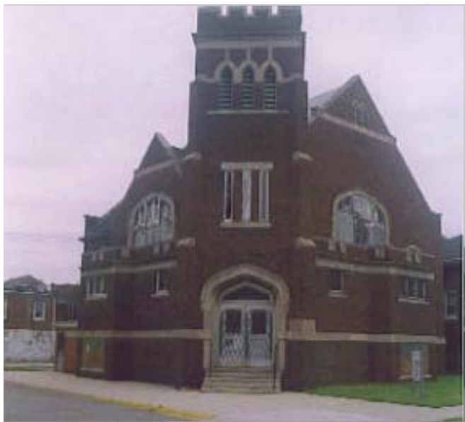
While this great little church on the corner of Grand Boulevard has seen better days, it still stands not only as an example of early 20th century church architecture, but more importantly, it stands as a link to the cultural heritage and diversity that is so unique to East Chicago. It's up to you - save it or raze it!

have been used as a fire safety and training facility for school children or as a fire fighter museum for those that serve and protect us in this great city. But those ideas were never considered at the time that the building was torn down.