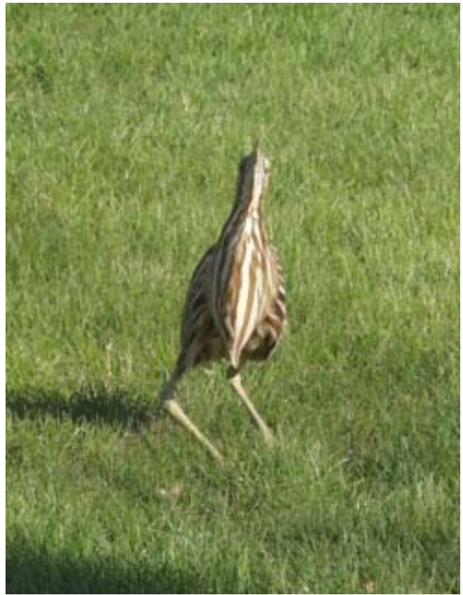
Above: A young American Bittern photographed in the Marktown Park this spring. A rare sighting anywhere in the Calumet Region, but especially in open parklands.