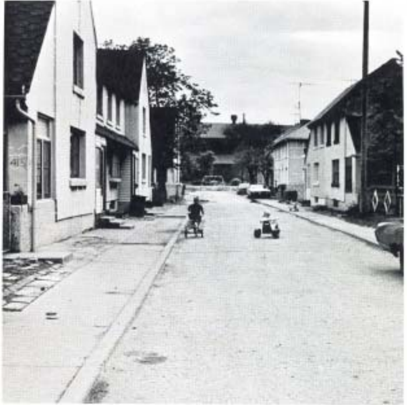
CHILDREN PLAY on Marktown streets in the shadow of Youngstown's No. 2 tin mill.

Recognizing the distinctive character of Marktown, it just recently was declared an official Preservation Site in the state of Indiana. Its people continue to regard their community with concern and affection. (continued on next page)