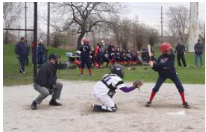
Lady Cardinals Softball Team in the Marktown Park.